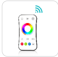
RGB+CCT Handhold remote