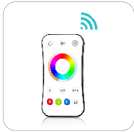
RGB+CCT Handhold remote